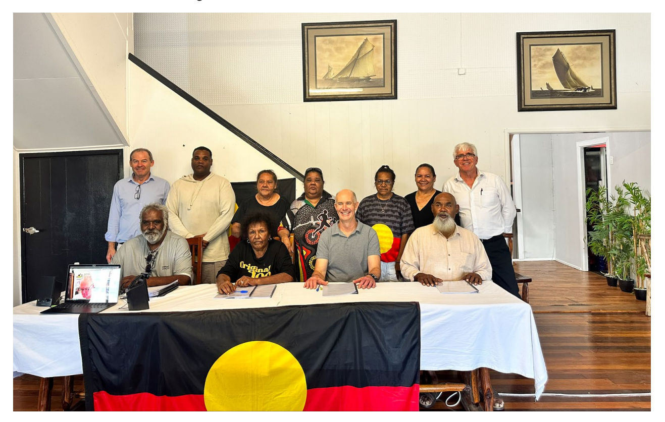
Figure: Signing of ILUA