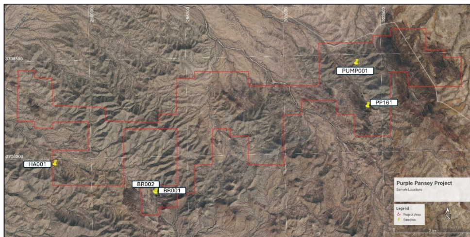
Figure 1. Purple Pansy Mn-Au Project - Sample Location Map

The assay results of the two samples confirm the high-grade nature of the manganese oxide mineralisation within the Black Rock Mine, which represents an immediate prospective exploration target. The Company will expedite works to develop an exploration program to determine lateral and depth continuation of the manganese through a combination of drilling, geophysical surveying and surface investigations.