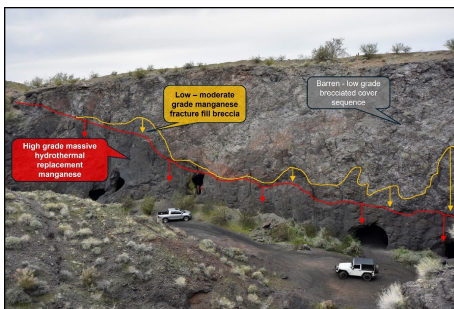
Figure 2. Black Rock Manganese Mine – Highwall with Exposed Manganese Oxide Mineralisation

The Company has engaged with geophysical consultants to define the specifications and requirements for the geophysical survey to delineate the potential total manganese oxide mineralisation area. Upon completion of the geophysical survey works, the Company will select target sites for drilling works sufficient to establish a maiden resource of remaining mineralisation at the Black Rock Mine site.