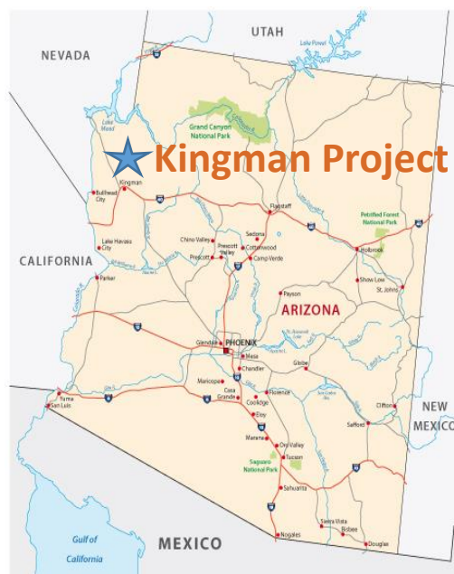
Figure 1: Project Location

The Kingman Project is held by Flagstaff Minerals Limited and located in the mining state of Arizona. The project area is approximately 145 kilometres from Las Vegas and is within 5km of US Highway 93. This area saw extensive mining activity in the early 1900's when numerous gold, silver and base metals mines were in operation. The project area comprises 195 highly prospective unpatented contiguous lode claims.