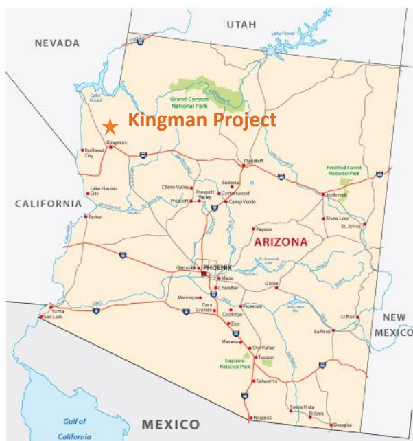
Map 1 – Location of Riedel's Kingman project in Arizona, USA

The Kingman Project is located in north-west Arizona, USA, approximately 90 minutes' drive from downtown Las Vegas and within 5km of a major highway (refer Map 1).