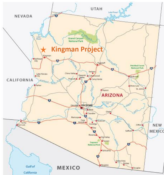
Map 1 – Location of Riedel's Kingman project in Arizona, USA

The Kingman Project is located in north-west Arizona, USA, approximately 90 minutes' drive from downtown Las Vegas and within 5km of a major highway (refer Map 1).