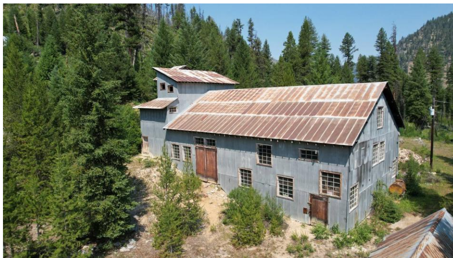
Figure 2: Johnson Creek Antimony & Tungsten Mill Site, located approximately 3 miles from the village of Yellow Pine, Valley County, Idaho, USA.

Resolution is nearing completion of its due diligence on the Acquisition and will advise the market of next steps in due course. The Acquisition of this mill site will significantly enhance Resolution's ability to aggressively advance its efforts to play a major near-term role in meeting the United States' demand for domestic critical metals production.