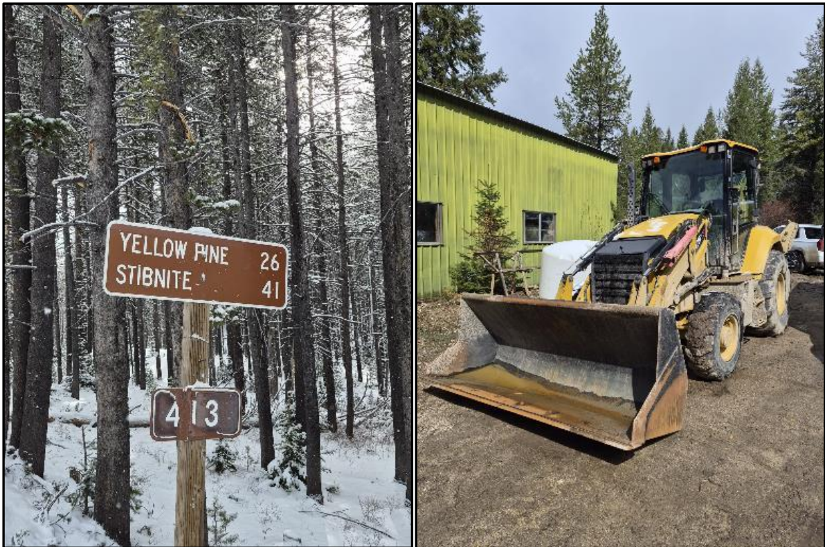
Figure 2: Access roadworks to Resolution’s Horse Heaven Antimony-Tungsten-Gold-Silver Project.