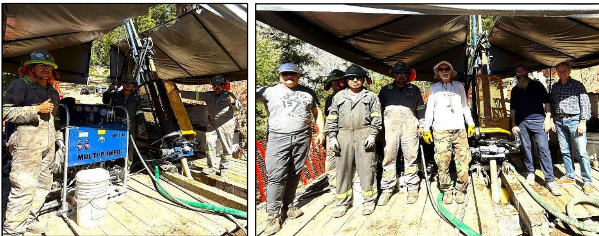
Figure 1: First drill hole 2026 Golden Gate program at RML’s Horse Heaven Antimony-Tungsten-Gold-Silver Project.

Site Visit by Board Members and Investors: A site visit of Resolution’s Horse Heaven Antimony-Tungsten-Gold-Silver Project in Idaho, USA, was undertaken by the RML Board and major investors, and witnessed the first hole being drilled this season (see Figure 1, 2).