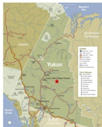
Figure 1. Yukon Base Metal Project location map

The original Project comprised 493 Mineral Claims covering 95 km 2 over and around the Andrew Zinc Deposit. The Company has since expanded its land position so the Project now comprises 1554 Mineral Claims covering approximately 305km 2 (see Figure 2).