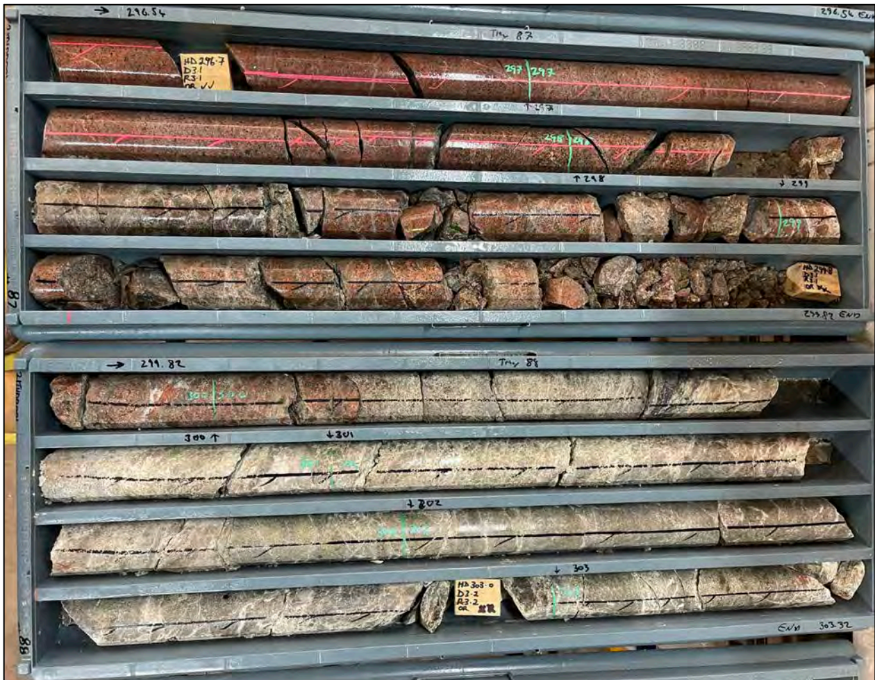
Figure 3. Contact between intense potassic alteration (red altered) and the quartz-sericite altered mineralised zone.