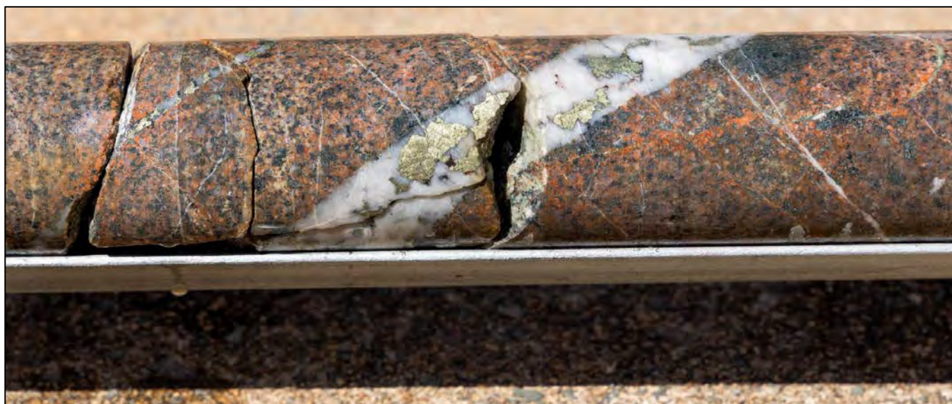
Figure 8. Chalcopyrite within minor molybdenum within vein in strong potassic altered granodiorite (381.1m).

The main chlorite-sericite-quartz mineralised zone grades into a zone of potassic alteration. The footwall potassic zone is characterised by regular quartz veining (1cm to 10cm thick) that typically contains chalcopyrite and pyrite. The regularity and thickness of the veining decreases at depth in the interval. As observed in the RC drilling, negligible molybdenite was observed within the footwall zone.