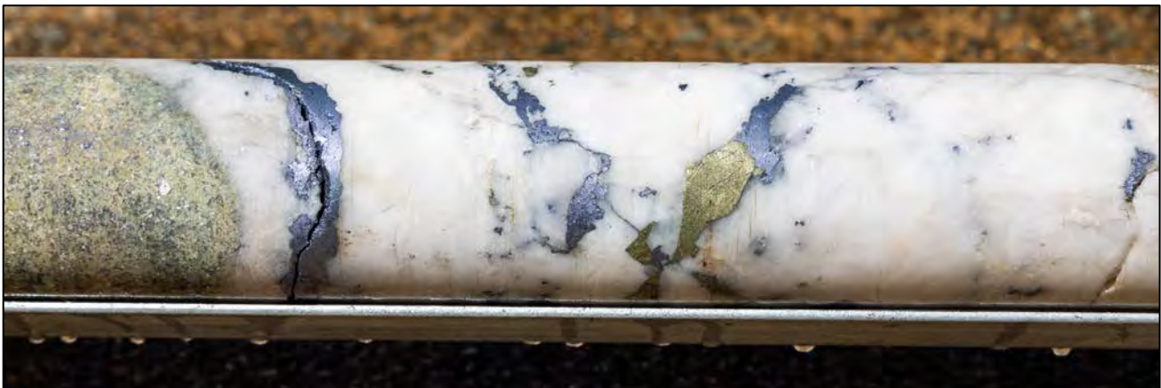
Figure 4. Molybdenite (blue/silver) and chalcopyrite (yellow) in quartz vein (338.1m).

The rocks are heavily brecciated and contain disseminated molybdenum throughout the sericite altered zone either side of the abrupt upper contact. Quartz veining is abundant throughout the mineralised zone. Veins vary in width from 1cm width to 60cm width and regularly contain coarse molybdenite and chalcopyrite. The zone reflects quartz abundances logged in the RC drill program and appears similarly proportional to the amount of veining mapped in surface outcrop.