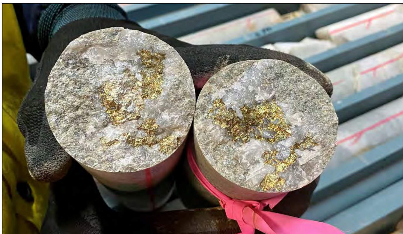
Figure 6. Chalcopyrite within core (333.3m).