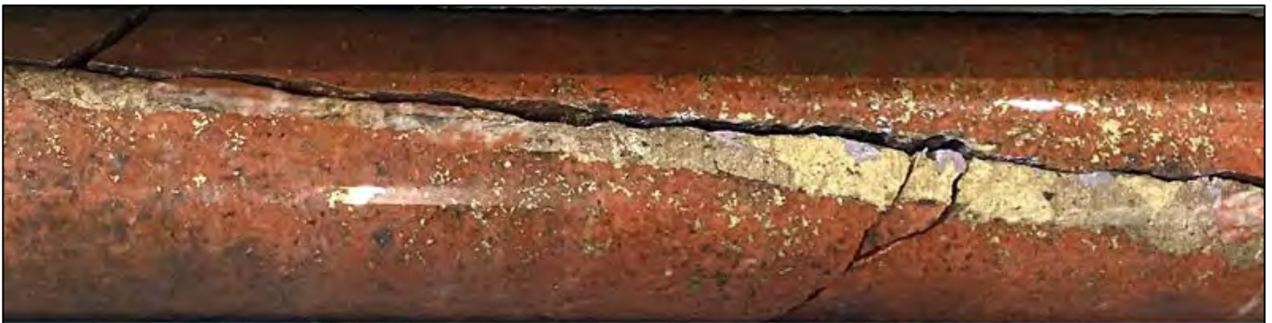
Figure 1. Chalcopyrite - pyrite in quartz vein and associated intense potassic alteration (149.4m).