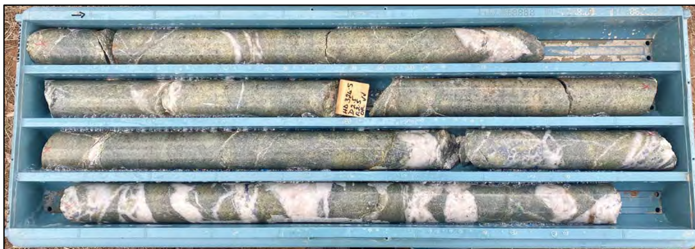
Figure 7. Abundant quartz veining and brecciation in intense sericite alteration (323.1m – 326.6m).