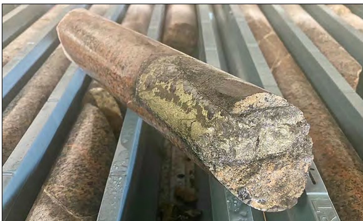
Figure 2. Chalcopyrite – pyrite within vein in strong potassic altered granodiorite (135.0m).

The granodiorite host becomes pervasively potassic altered. The intensity of alteration increases from weak to intense toward the end of the interval. The pervasive potassic alteration also contains weak disseminated pyrite and chalcopyrite throughout. A sharp contact between the potassic zone and the mineralised zone is encountered at 300.1m (Figure 2).