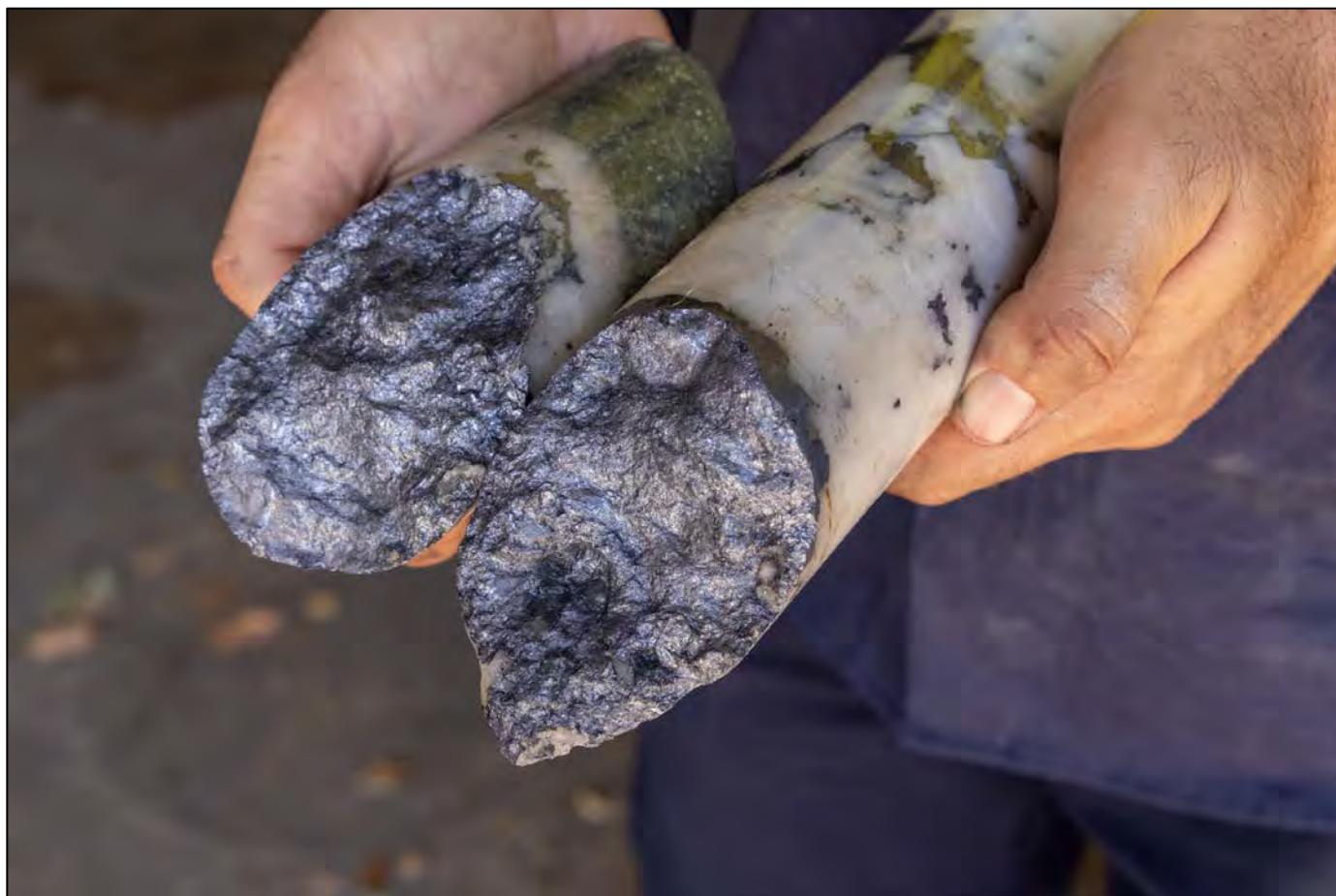
Figure 5. Molybdenite in quartz vein (338.1m).