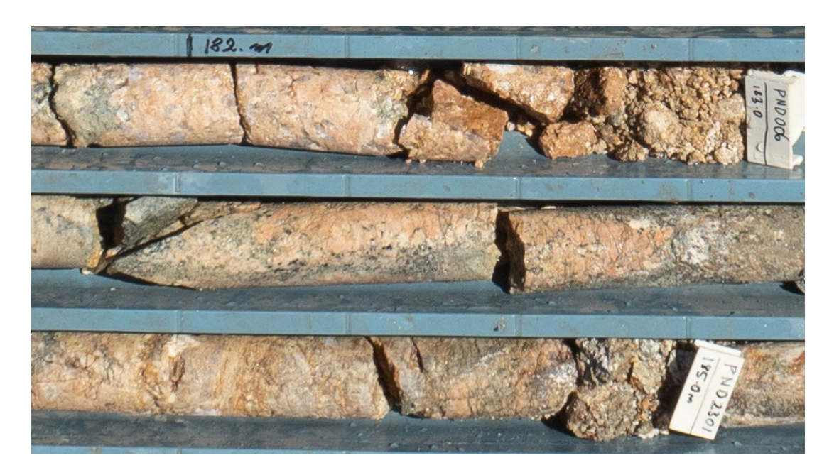
Figure 2 – PND006 Drill Core: Weathered pegmatite with weakly anomalous Ag, As, Bi (section shown covers part of interval 182.7 to 185.1m)

Significantly, some other known mineral systems in the Paterson region are associated with bismuth anomalism and potassium-feldspar alteration. The presence of similar pathfinder anomalism and alteration at Rim may be indicative of proximity to mineralisation.