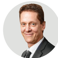
Robert Friedland Co-Chairman

Sunrise is one of the world's most exciting, development ready integrated battery materials projects. As the world coordinates global action to tackle carbon emissions and air pollution, the Board and management team remain confident in your company's capacity to deliver an important contribution to our shared future.