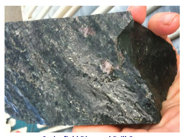
Springfield Diamond Drill Core showing Disseminated Chalcopyrite

The results to date are considered to continue to be highly encouraging and also geologically significant. Additionally, they are providing an important framework and valuable geological knowledge for future exploration to potentially vector into a stronger mineralised system.