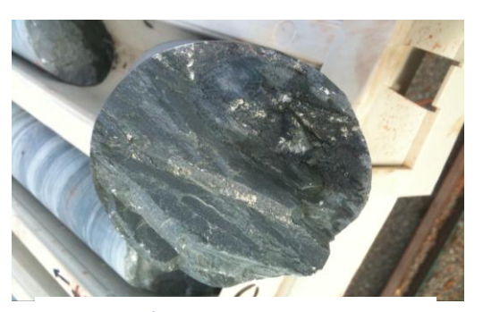
Springfield Diamond Drill Core showing Disseminated Chalcopyrite