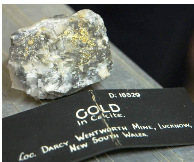
Historic Sample: Gold in calcite from Wentworth Mine, Lucknow, NSW

The Lucknow Goldfield was discovered in 1851 and was one of the earliest goldfields to be mined commercially in Australia. Historic production records at the Project are incomplete, however in excess of 400,000 ounces of gold has reportedly been produced at grades of 100 to 200 g/t 1 .