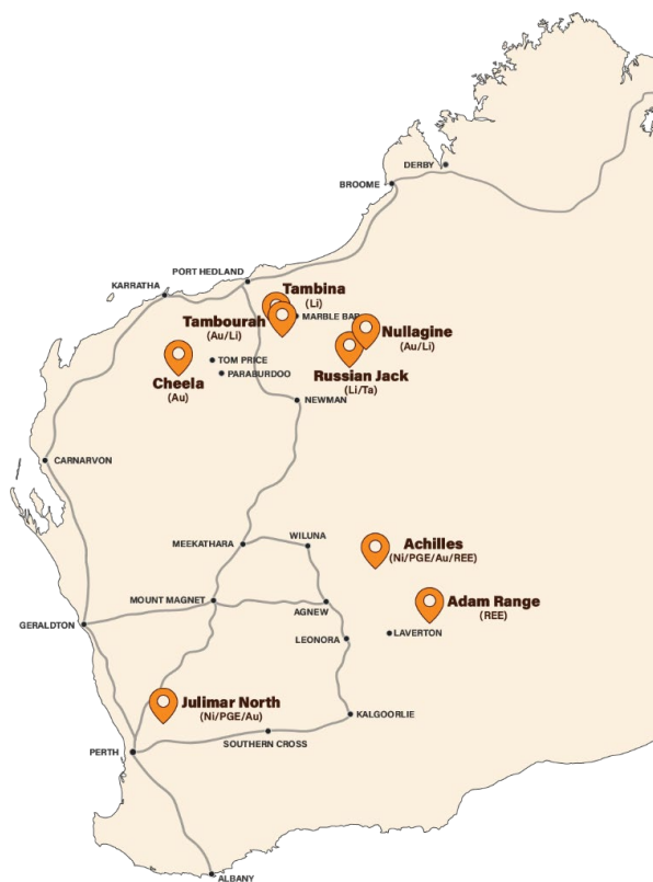
Figure 3: Tambourah Metals Projects- Location Map