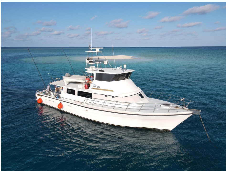
Reel Teaser Fishing Adventures based in Broome Western Australia have purchased a VG120 VEEM Gyro to enhance the customer experience.

Investor Relations Simon Hinsley +61 401 809 653 simon@nwrcommunications.com.au