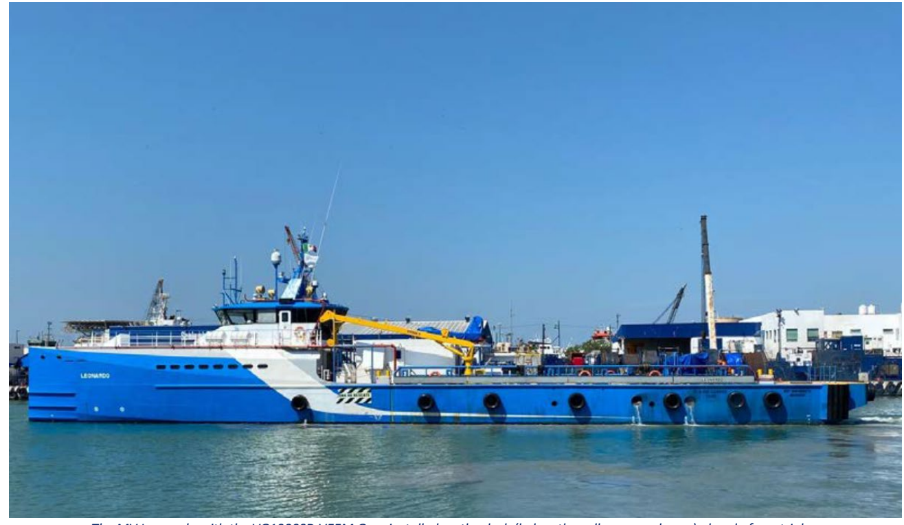
The MV Leonardo with the VG1000SD VEEM Gyro installed on the deck (below the yellow crane boom) ahead of sea trials.

The VG1000SD VEEM Gyro (now named the VG520/1000SD) is the most powerful marine gyrostabilizer in the world generating 1000 kN.m of stabilizing torque and 520 kN.m.s (kilonewton metre seconds) of angular momentum. There is no alternative to the VG1000SD in the large heavy-duty marine stabilization market.