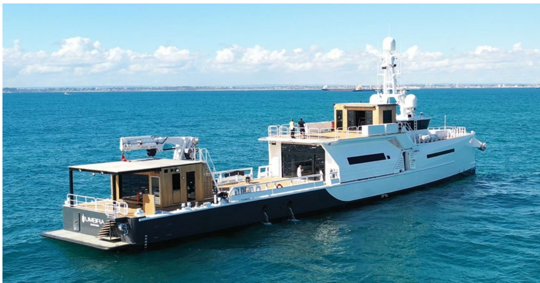
The M/Y Umbra at Sea Trials off the coast of Australia.