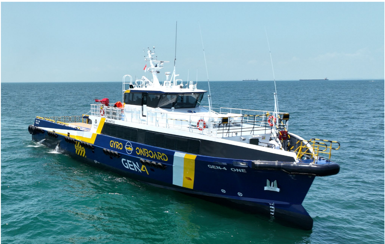
Strategic Marine's Gen 4 fast crew boat with "GYRO ONBOARD" sign