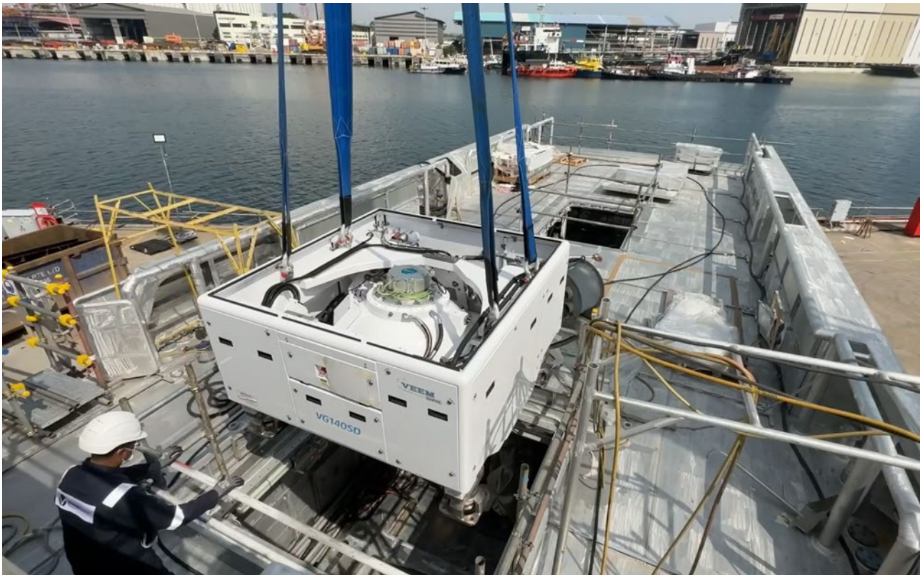
A VG140 VEEM Gyro being installed into Strategic Marine's Gen 4 fast crew boat