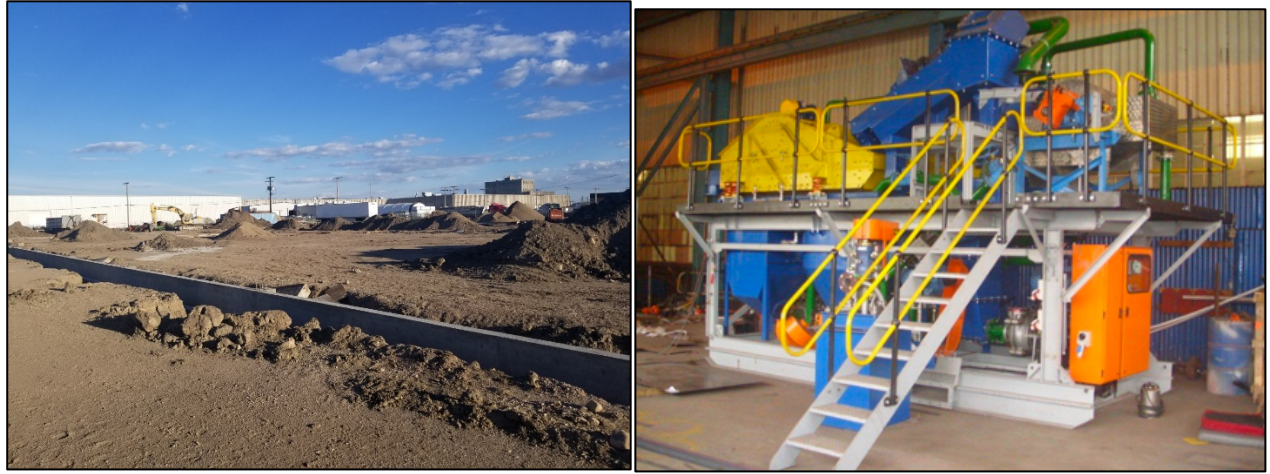
Figures 2 & 3 - Construction is underway on Vital's rare earth extraction facility in Saskatoon, which will incorporate a Dense Media Separator (right) in the extraction process

Commissioning of the plant is expected to occur incrementally over the first half of CY2022 and first product out is scheduled to occur end of H1 CY22.