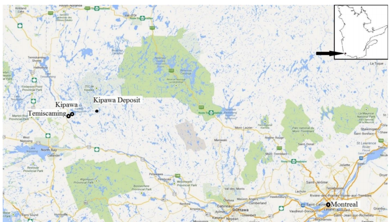
Figure 4 - Location of Kipawa rare earth project, Quebec, Canada

During the quarter, Vital announced it had signed a binding term sheet with Quebec Precious Metals Corporation (TSX.V: QPM, OTCQB: CJCFF, FSE: YXEP) ("QPM") ) for VML's acquisition of QPM's 68% interest in the Kipawa exploration project and 100% interest in the Zeus exploration project (the "Projects") for C$8m, payable over 4 years. Joint Venture partner Investissement Québec ("IQ") holds the remaining 32% of the Kipawa project on a contributing basis.