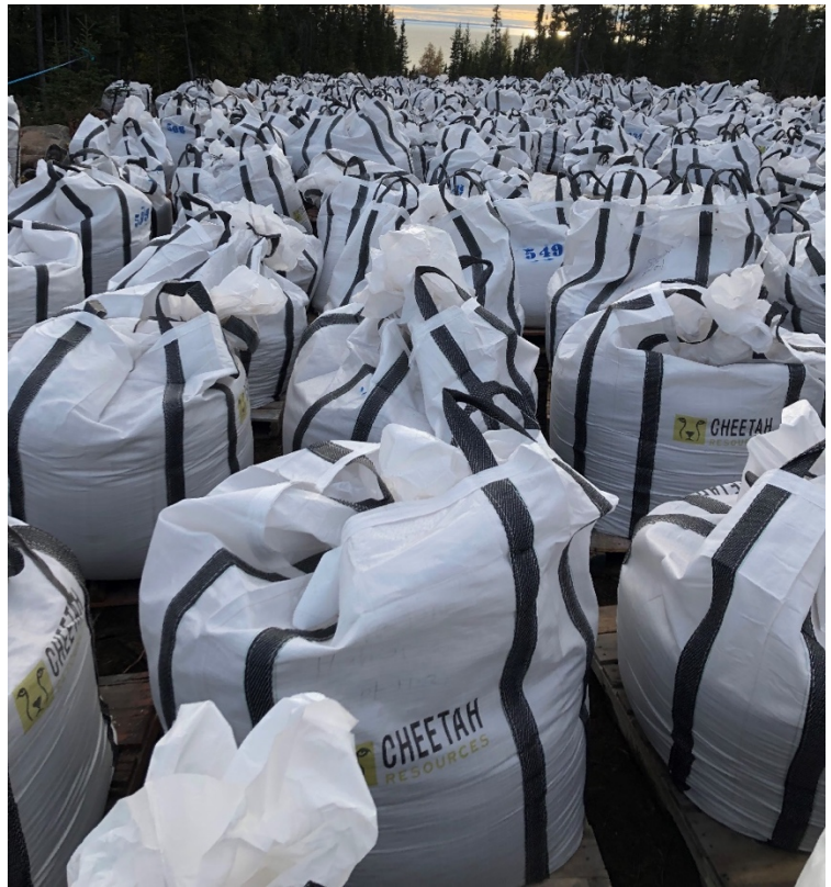
Figure 1 - Bags of rare earth concentrate produced at Nechalacho awaiting shipment