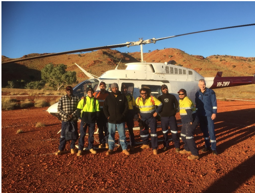
Sulphur Springs Heritage Survey with The Nyamal People.

Following the receipt of formal approval from the WA Environment Minister in May 2020, detailed work continued various DMIRS Mining Proposal requirements.