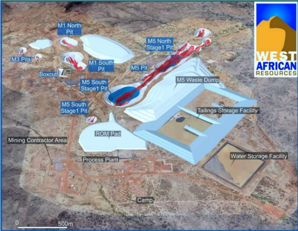
Figure 1: Sanbrado Gold Operation Layout