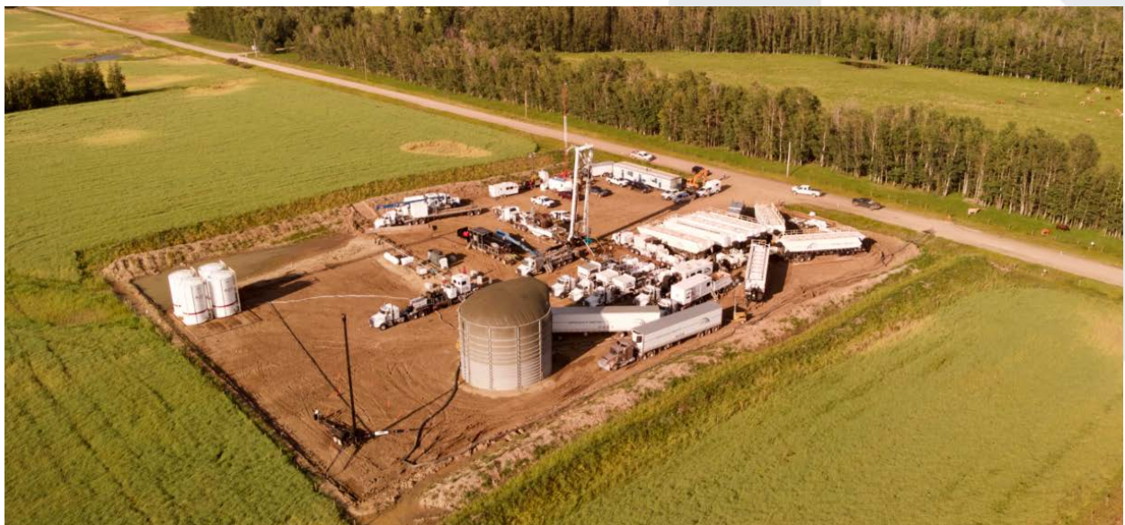
Figure 2 - Rex-2 Frac Spread

The next phase of the program, commencing flowback and testing, should start within 48 hours. As is the practice by other operators in the area, a high-volume, submersible pump will be used to assist with the recovery of frac fluids and to optimise the oil recovery rate.