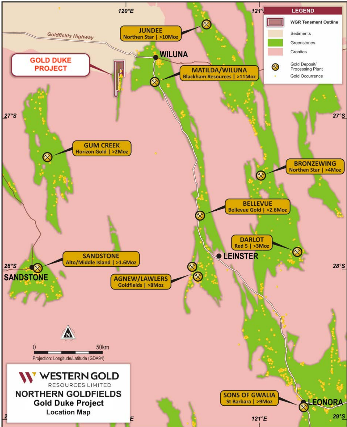
Figure 1 – Gold Duke Project located in the Norseman- Wiluna gold region