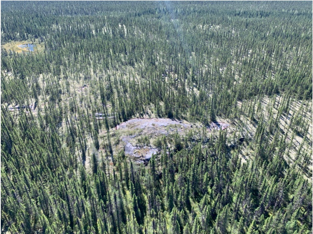
Figure 2 – New pegmatite outcrop viewed from the air