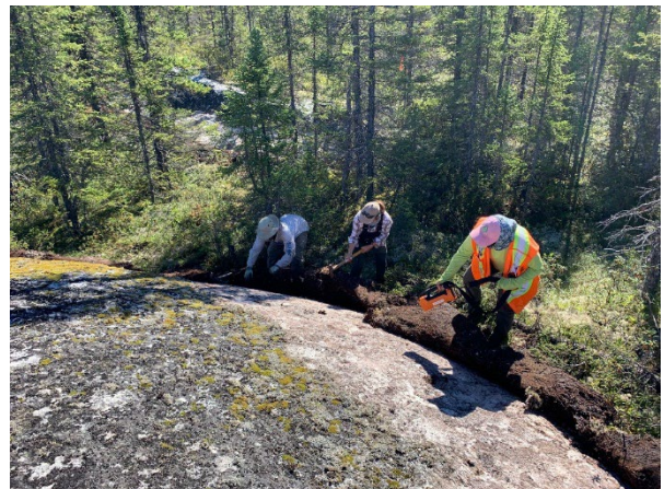
Figures 3 & 4 - Field team members examining new pegmatite outcrop at Adina