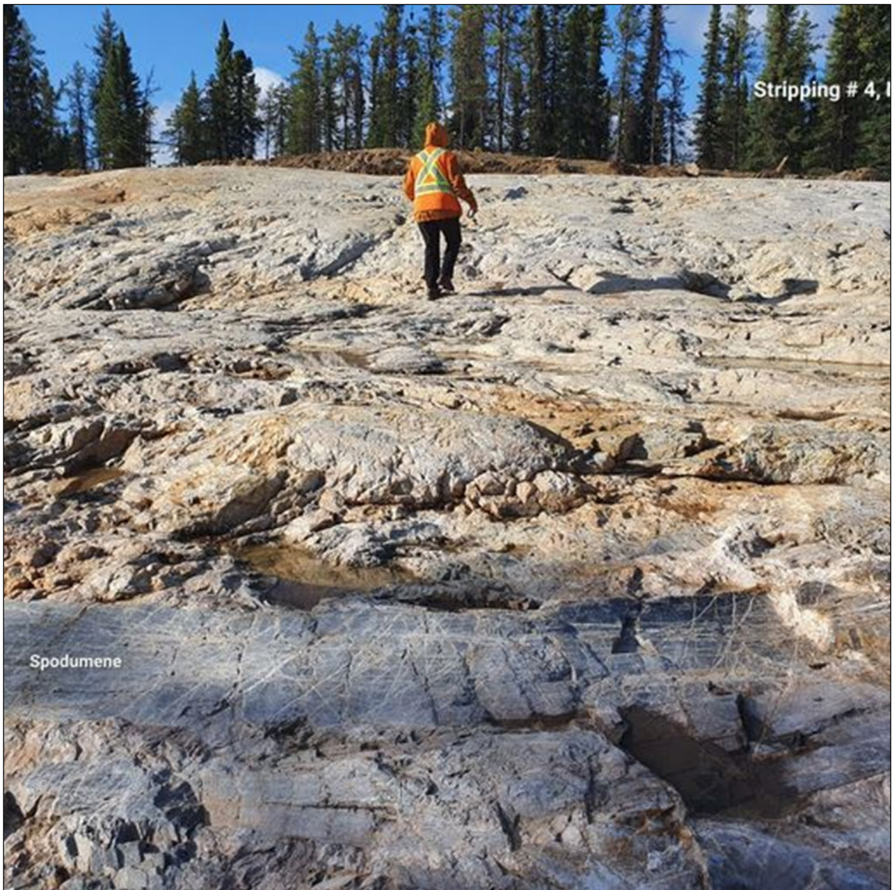
Figure 3: North view of the main dyke at Cancet showing spodumene crystals exposed during stripping. 3