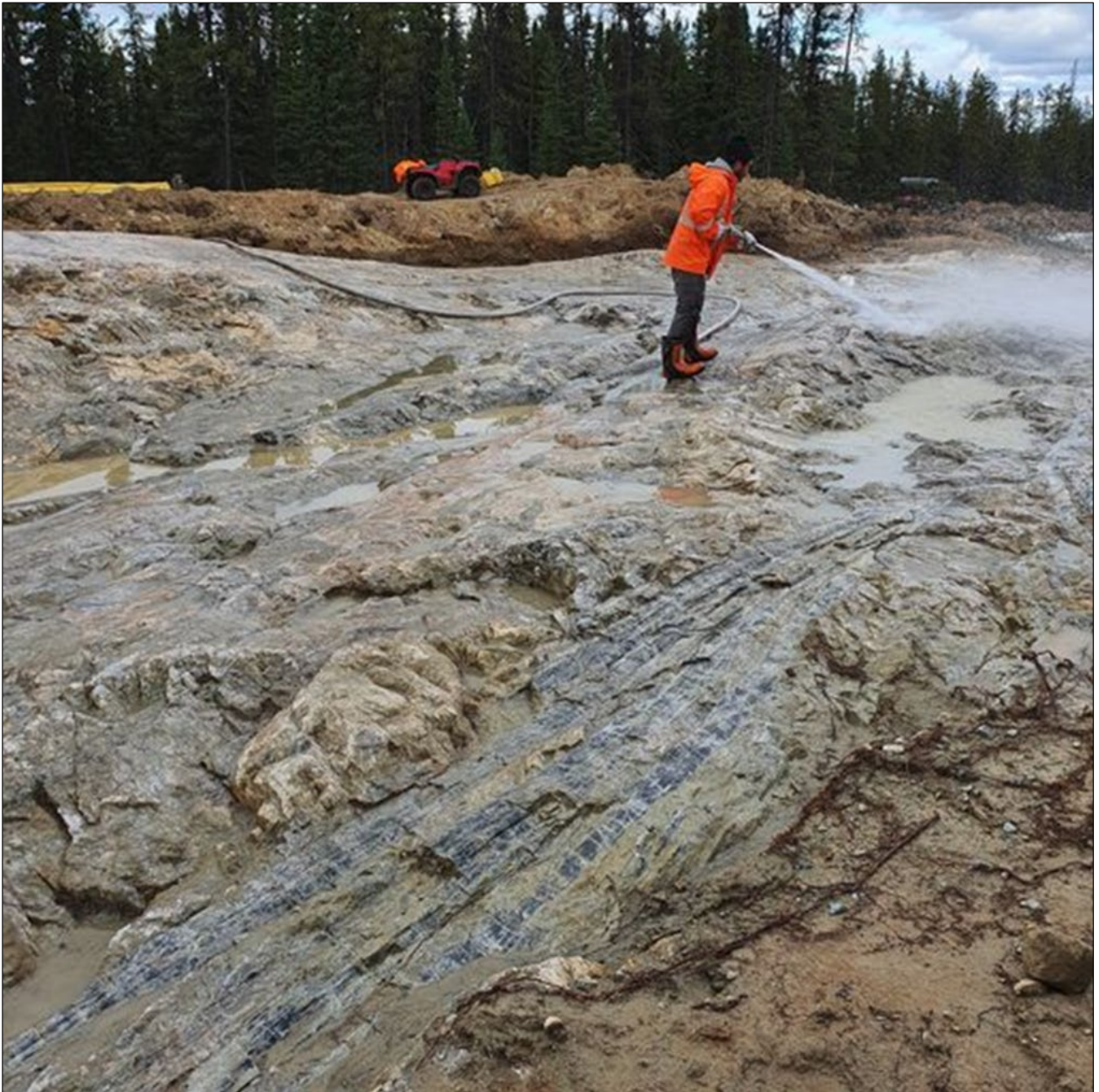
Figure 6: North-east view of the main dyke at Cancet showing spodumene crystals exposed during stripping.