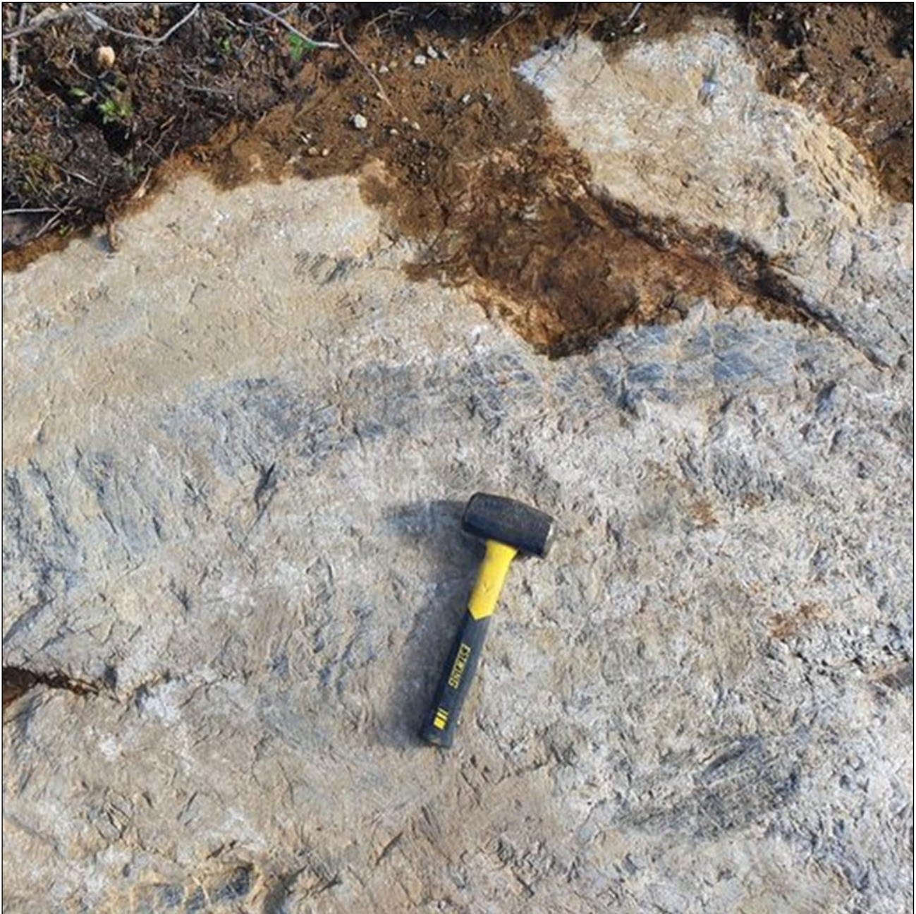
Figure 4: Spodumene crystals exposed during stripping of the Cancet main dyke.