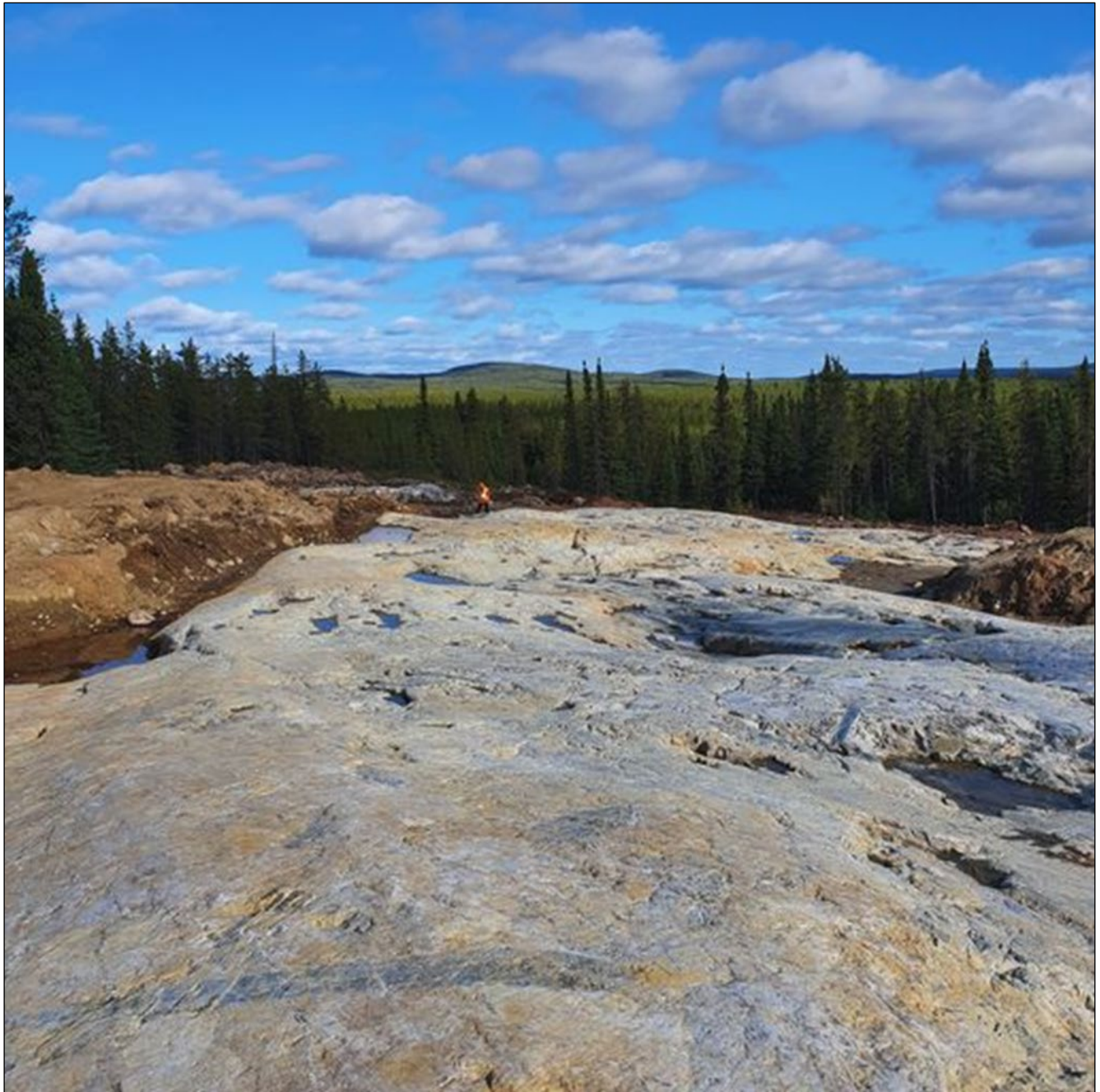
Figure 5: East view of the main dyke at Cancet showing spodumene crystals exposed during stripping.