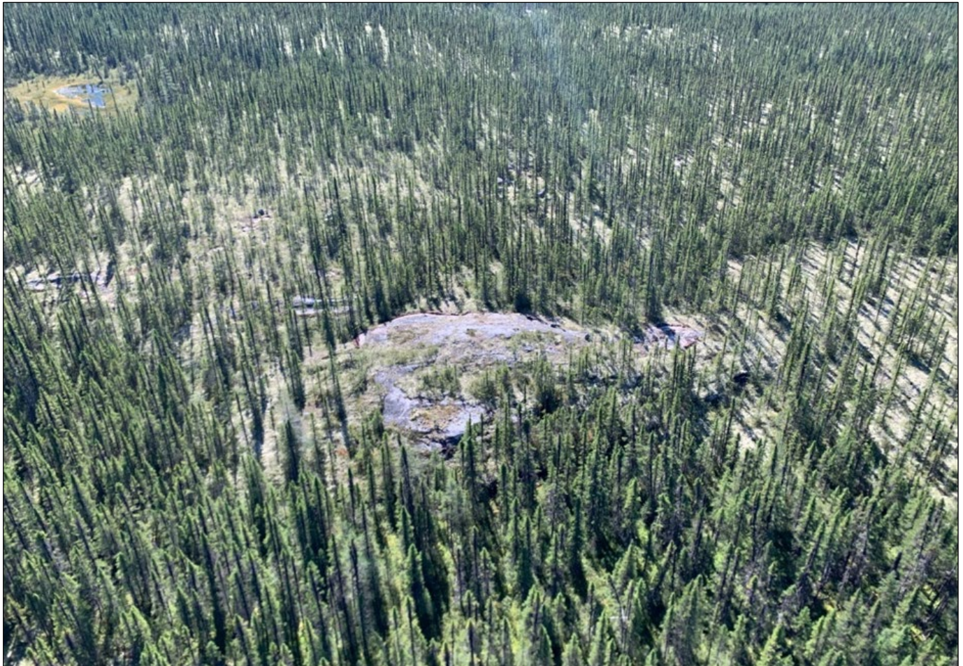
Figure 8 – The new Jamar Discovery outcrop viewed from the air.