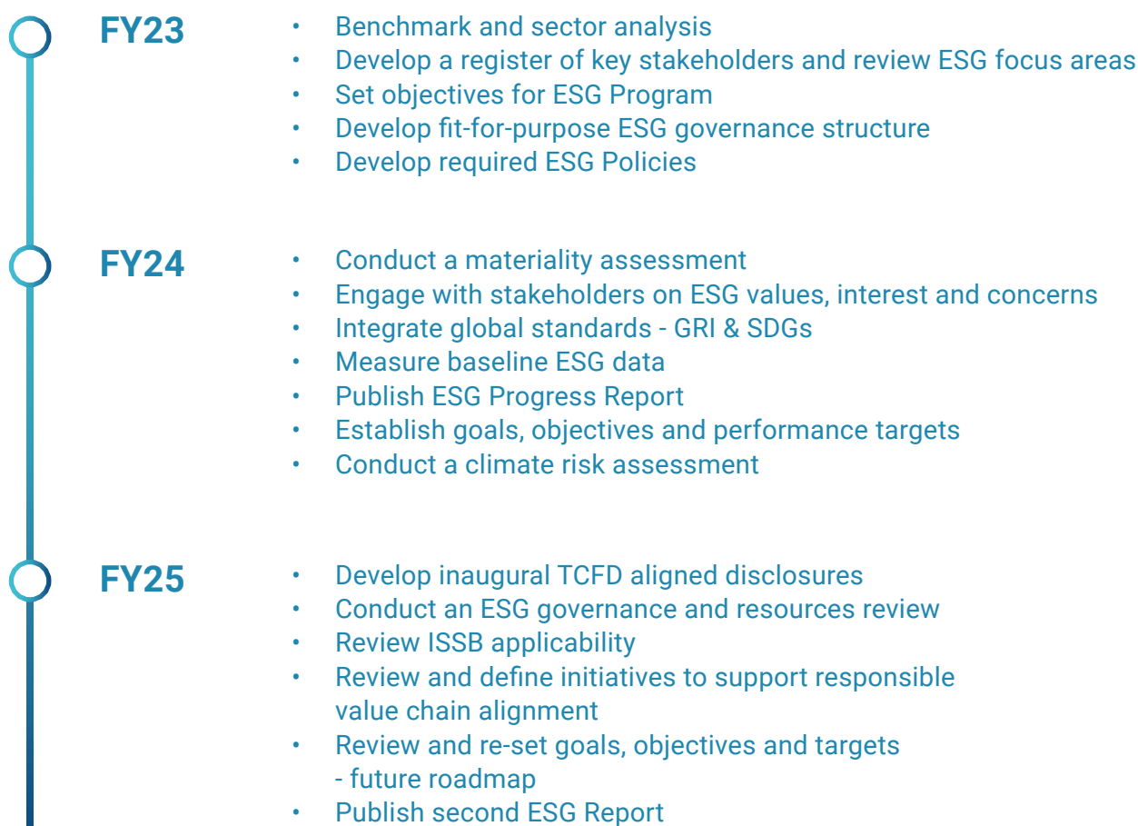
Figure 1 – Winsome Resources ESG Roadmap

Winsome is also dedicated to working in partnership with the local First Nations communities to build long-term, trusting relationships, understand and protect local heritage, and identify local employment and other opportunities for First Nations communities to work alongside the Company Through its developing ESG strategy, Winsome aims to create long-term value for its shareholders, employees, and the broader community while upholding its social and environmental responsibilities.