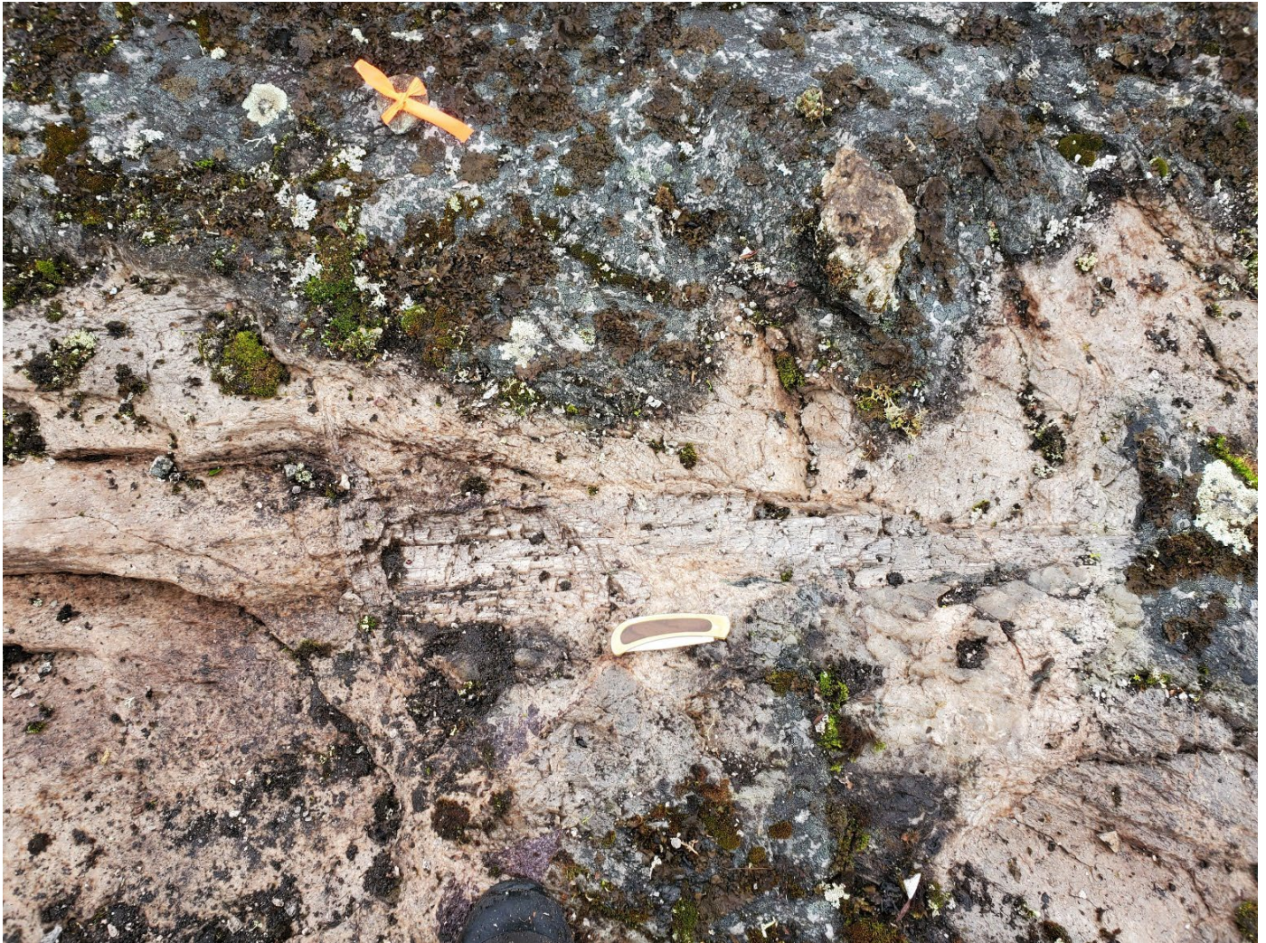
Figure 2: Spodumene-rich zone within pegmatite at Tilly.

The Tilly Project was acquired in April for an initial payment of C$70,000 with further share-based payments due upon the project achieving certain milestones (refer ASX Announcement 19 April 2023). Exploration of the Tilly Project has been undertaken as part of exploration at Adina, in parallel with drilling activities. The successful discovery of this pegmatite at Tilly reflects the Company's systematic exploration approach which has been refined during exploration of the Cancet and Adina properties and led to the discovery of the Adina Main Zone (formerly Jamar).