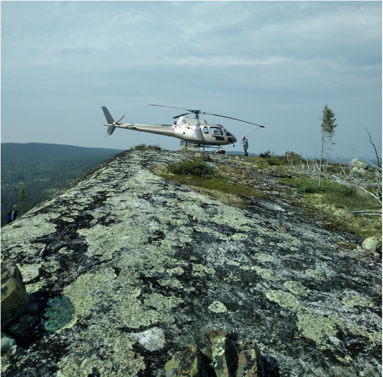
Figure 1: Mineralised pegmatite outcrop at Tilly Project.