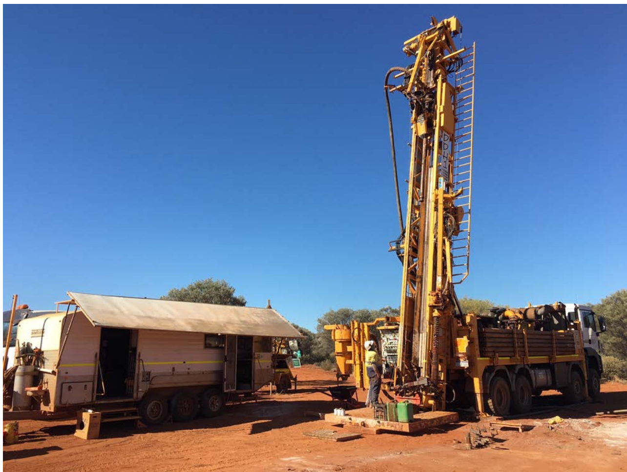
Figure 3 – drill rig at Mt Alexander on 27 August 2018; drilling of MAD114 is underway

Further modelling of this target is being completed ahead of drill testing in the current programme.