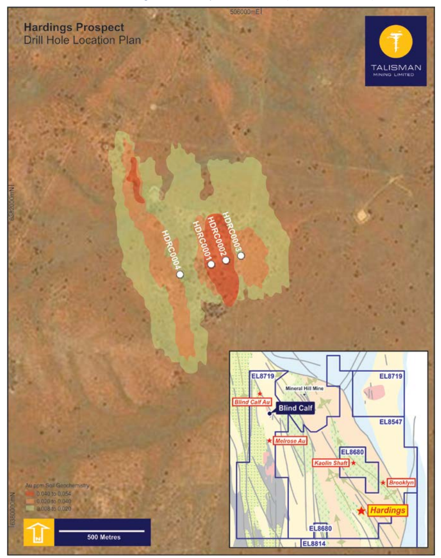
Figure 3: Harding's gold-in-soil RC drill collar location plan<sup>4</sup>

Results from assays have shown thin isolated zones of elevated gold mineralisation, with one intersection consistent with the surface geochemical anomalism. Gold assays returned were less than 0.5 g/t and are not considered significant by Talisman (refer Table 2 ).